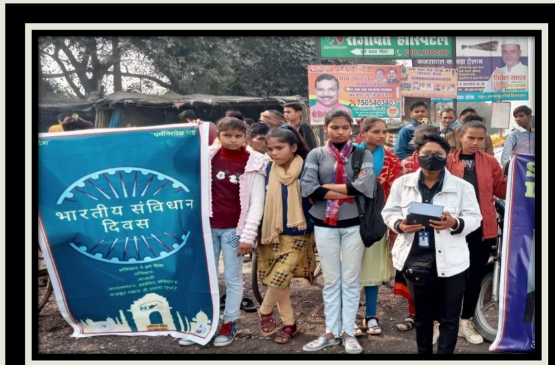
➤ Samvidhan Divas Celebration