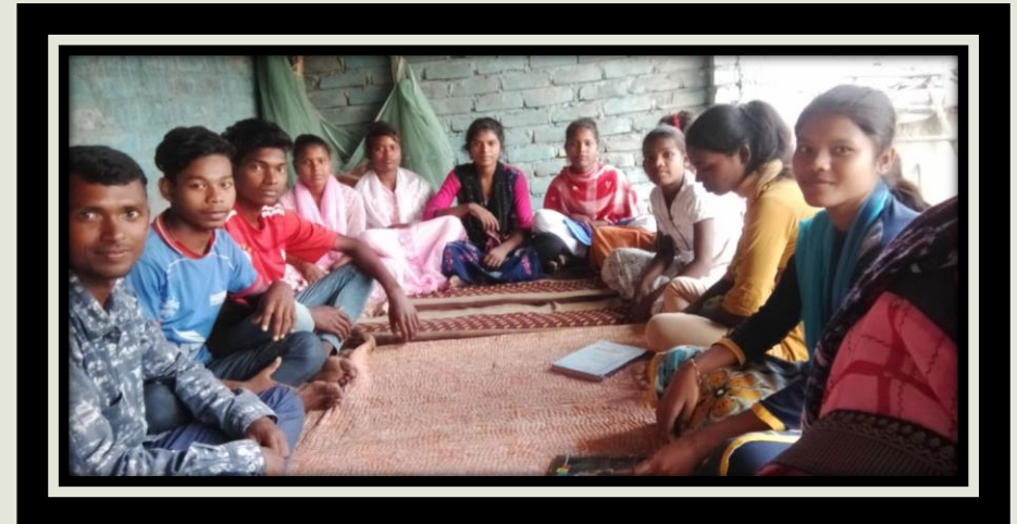
➤ Weekly Meeting