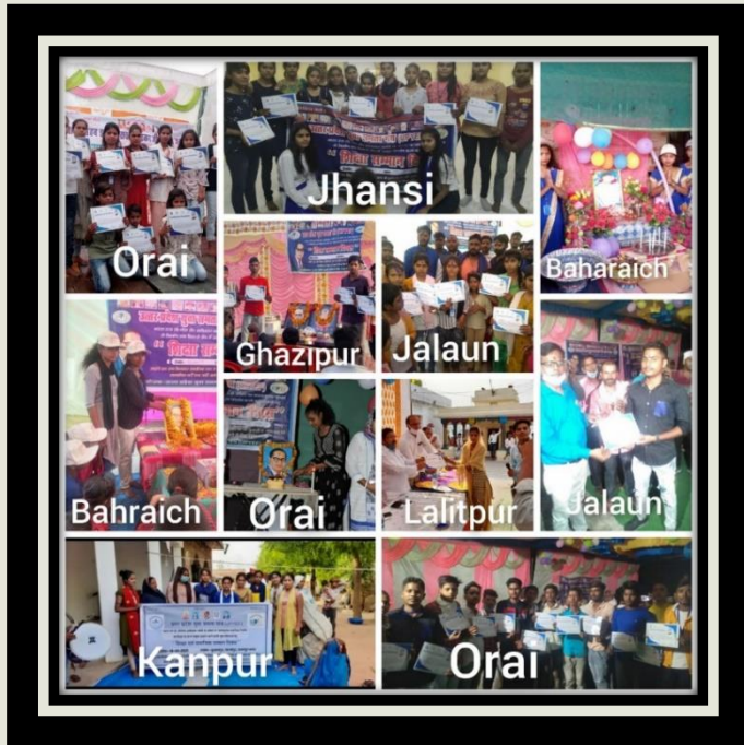
➤ Siksha Samman Divas